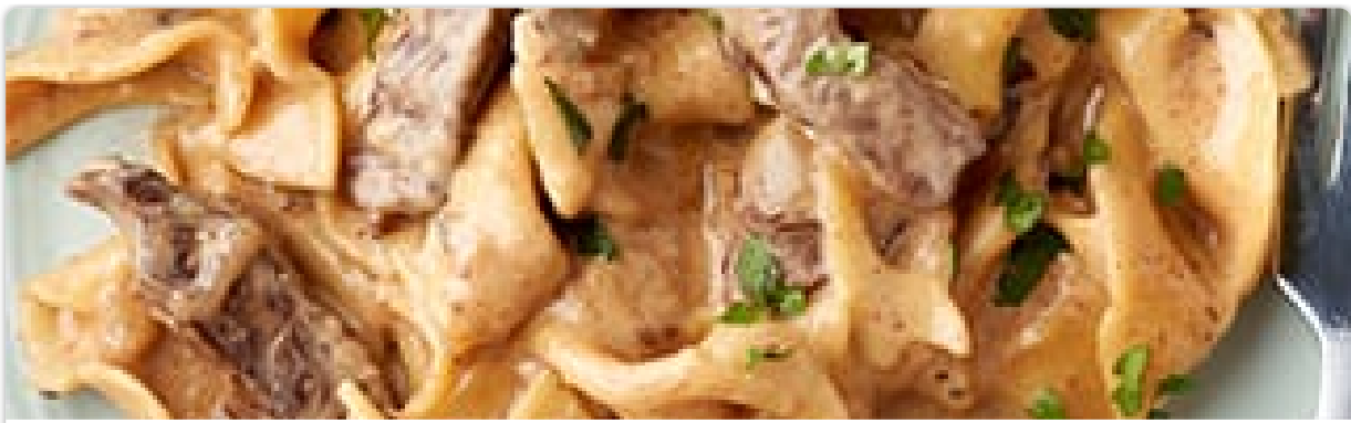
Beef Stroganoff Made With Campbells® Healthy Request Cream Of Mushroom Soup