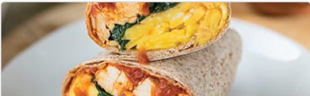
Breakfast Burrito Made With V8® Original Vegetable Juice