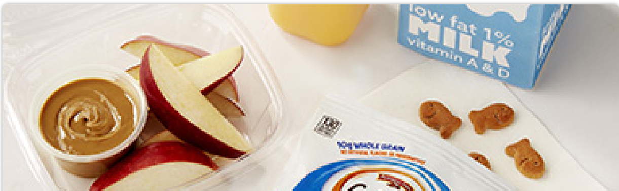
Apple Dunkers Made With Goldfish® Grahams Baked With Whole Grain Honey Bun